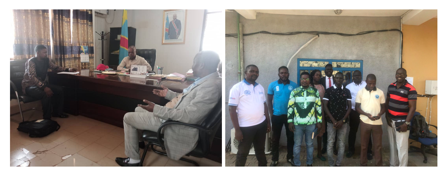
Photo above: CSO rep and journalist visit the Kwilu's Governor Office to discuss 2023 budget line for polio and immunization.