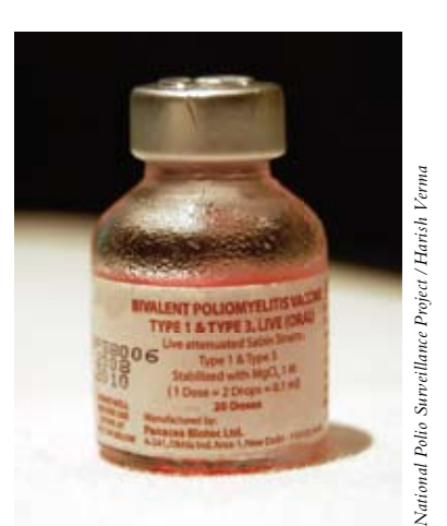
Bivalent OPV: an important new tool for the Global Polio Eradication Initiative.

depending on the outcome of this trial, that major strategic shifts in the use of these products should be anticipated (as is the case with bOPV). These clinical trials will help inform the finalization of the new Global Polio Eradication Initiative five-year Strategic Plan (expected for publication in January 2010).